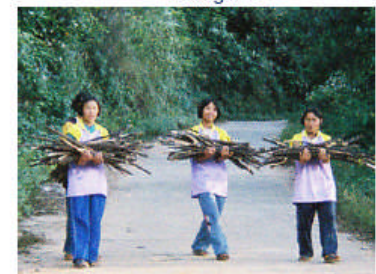
Below, carrying wood with head straps