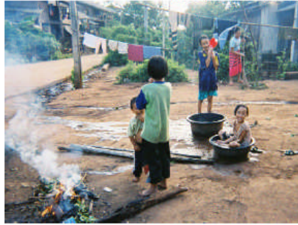
Bathing and washing clothes