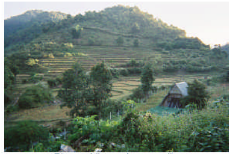
Rice paddies and surroundings