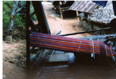
Weaving traditional Karen Hilltribe clothing