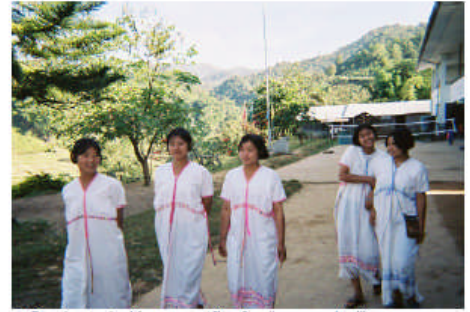
Students in Karen outfits for "unmarried" women