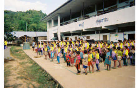
Elementary and middle school (K-9)